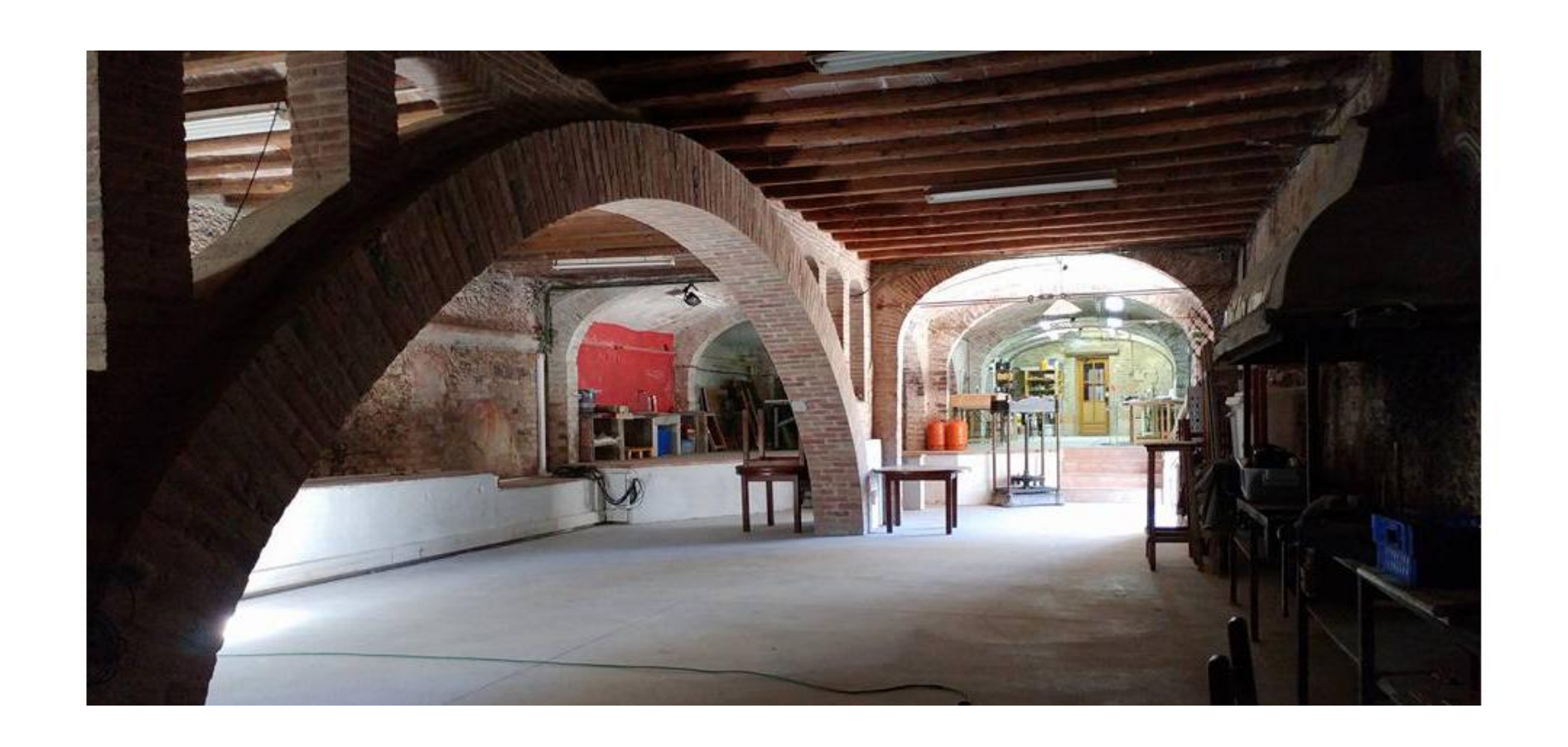
The Bodega in Can Serrat, one of the communal studios