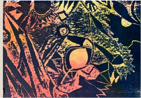
Sagrada Familia # 12, 2022, 7"x11' Woodcut print and acrylic on paper