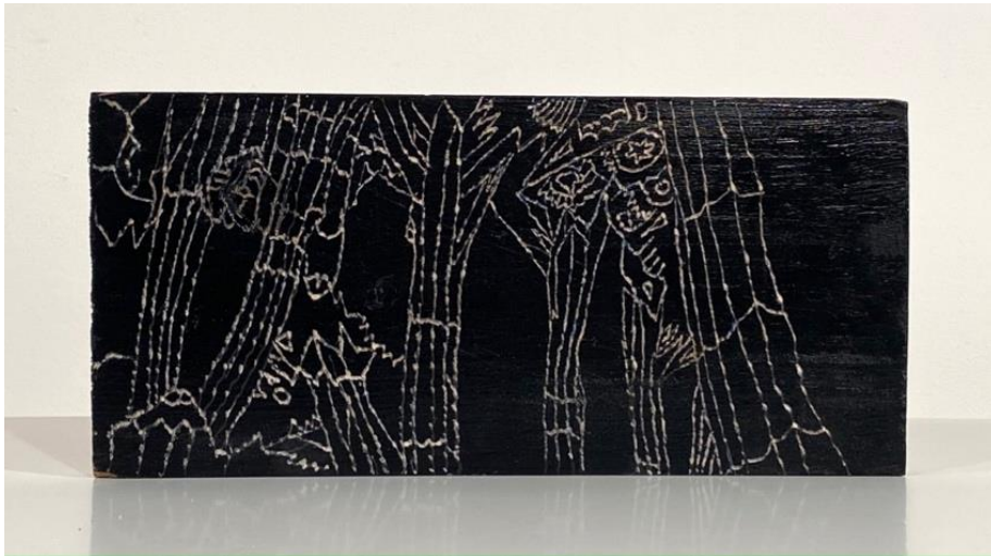
Sagrada Familia #1, 2022, 6"x13"x3/4," woodcarving on painted wood block

My original intent was to make organic sculptures with wood inspired by Antoni Gaudi's architecture in Barcelona. Due to the limitation of woodworking machines in Can Serrat, I shifted my focus on the use of the Press for printmaking, the only equipment available in the studio. Being a wood sculptor for many years, I experimented on wood carving and making woodblock prints. I also learned mono-printing from another artist in the studio during my residency. Here are a few examples.