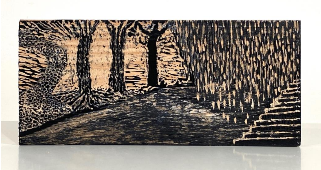
Can Serrat #2, 2022, 6"x12.5"x3/4", wood cut on painted wood block