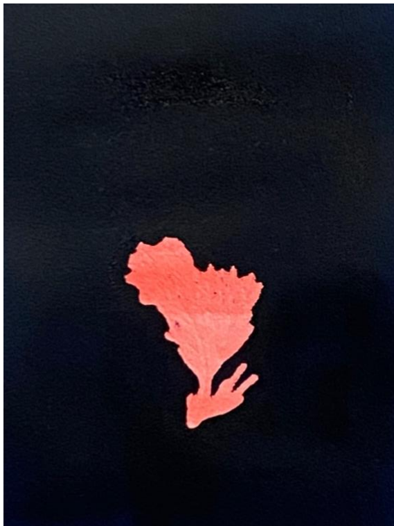
Juniper, 2022, 9" x 13.75", monoprint and acrylic on paper