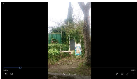
3. (screenshot of video)