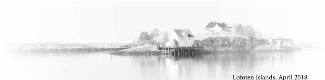
Lofoten Islands, April 2018