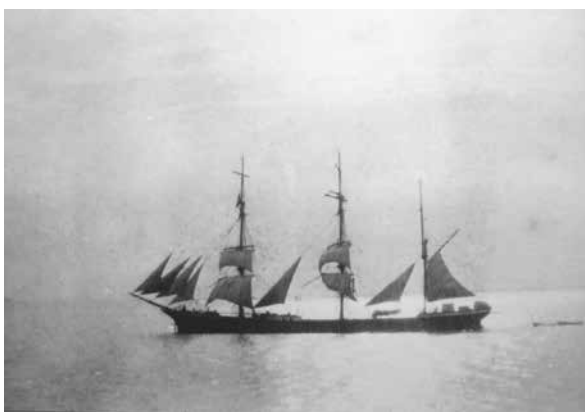
Imaginary's boat, postcard 1929