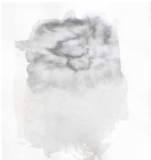
Fiction's schemes, indian ink on paper, 2018