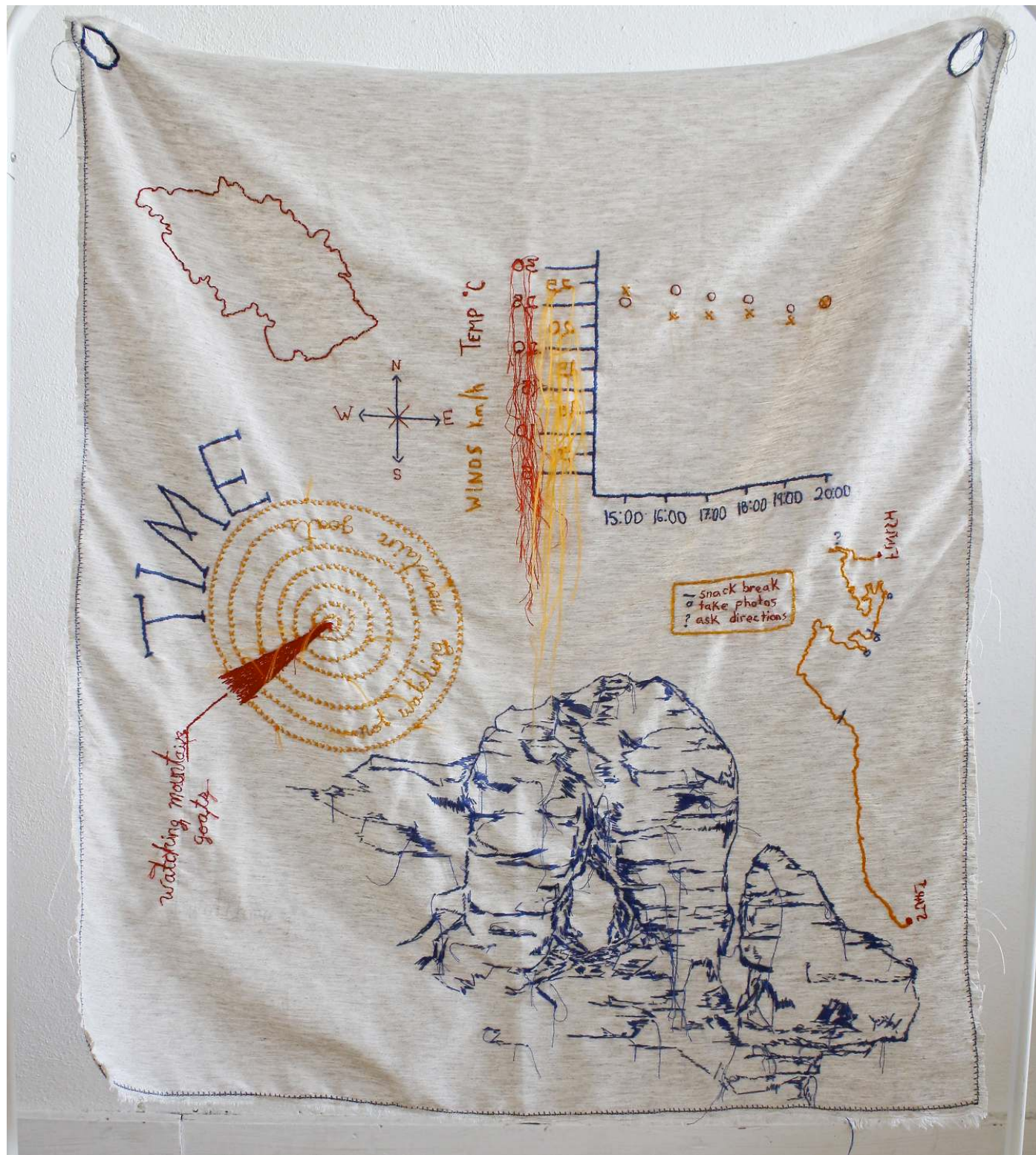
Hike To The Portal

89 x 103 cm fabric, embroidery thread 2017